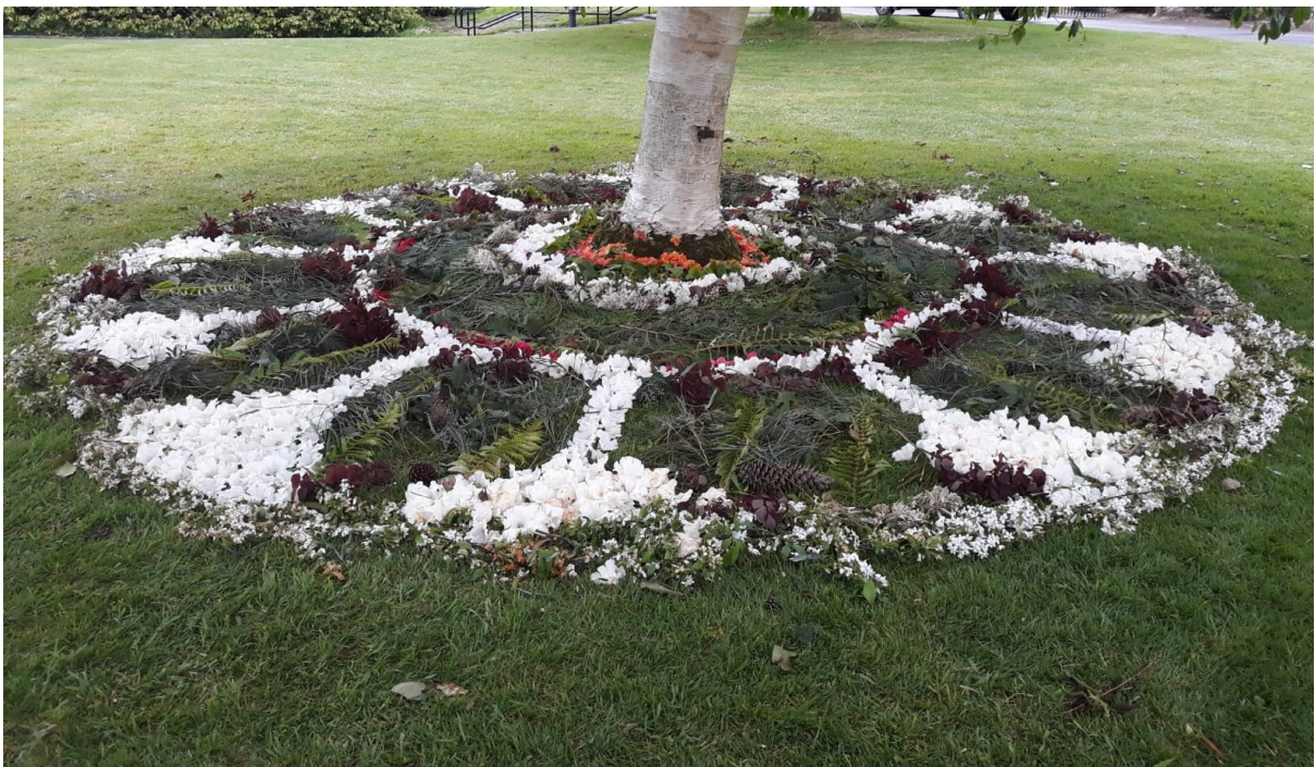
Mandala created at the JFK Memorial Park & Arboretum. A tree marks the centre of the mandala.

The construction of a mandala can be very rewarding, you will have fostered a love of nature, encouraged teamwork and have created a happy memory for the family. Remember use your imagination and create your own designs.