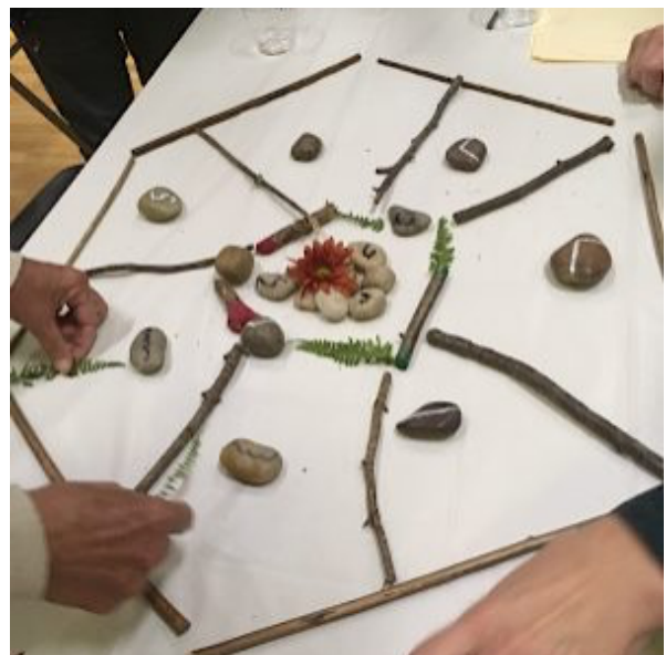
Mandalas created on a clear area.