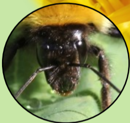
Garden Bumblebee, Bombus hortorum

Tail white. Two yellow bands on the thorax, and one on the abdomen. The face is long. A very similar species, the Heath Bumblebee, Bombus jonellus , has a short face. (Not illustrated.)