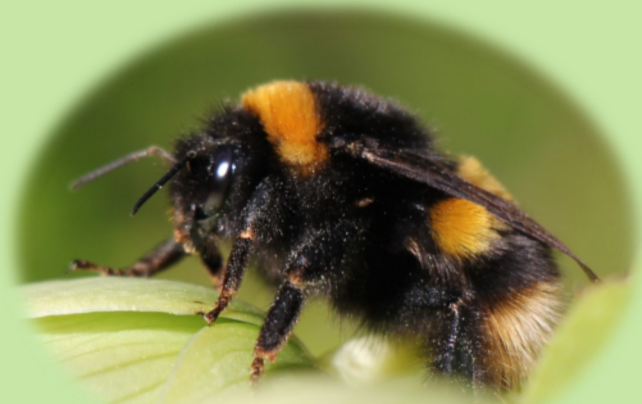
Buff-Tailed Bumblebee, Bombus terrestris

Only mated queens overwinter to start a new colony in the spring. The nest is usually underground. The queen raises the first brood of workers. Then the queen stays in the nest laying eggs while the workers forage for food.