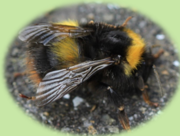
Early Bumblebee, Bombus pratorum

Tail white. One lemon-yellow band on the thorax, and one on the abdomen. A complex of three identical species that can only be separated by DNA analysis.