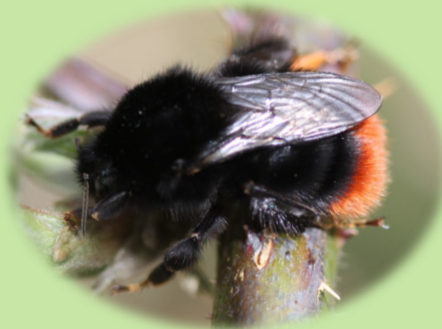
Red-Tailed Bumblebee, Bombus lapidarius

A variable species, but always with a ginger thorax and tail, and some black hairs on the abdomen.