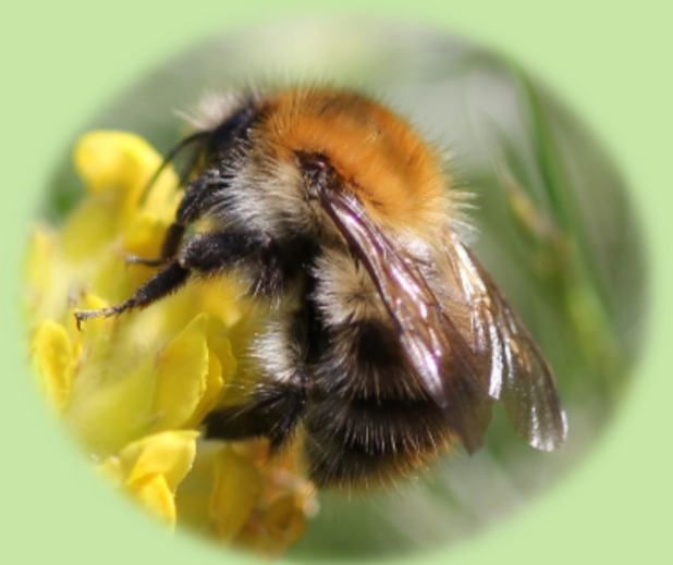
Common Carder Bee, Bombus pascuorum

Tail white. Two yellow bands on the thorax, and one on the abdomen. The face is long. A very similar species, the Heath Bumblebee, Bombus jonellus , has a short face. (Not illustrated.)