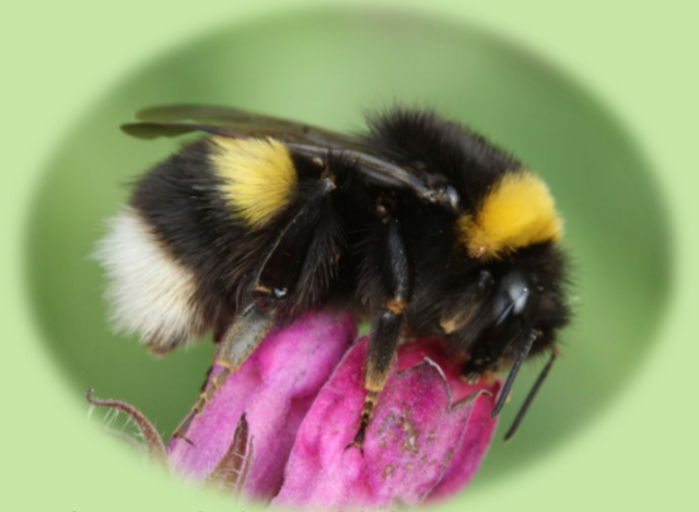
White-Tailed Bumblebee, Bombus lucorum agg.

A large species, with one orange-yellow band on the thorax, and one on the abdomen. Tail may be buff or off-white.